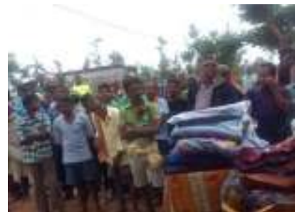
Blanket distribution in “HUDHUD” affected at Subalada & Chelligada village of Gajapati District