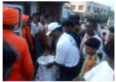
Medicine & Dry food distribution in “HUDHUD” affected at Foka & Laba villages