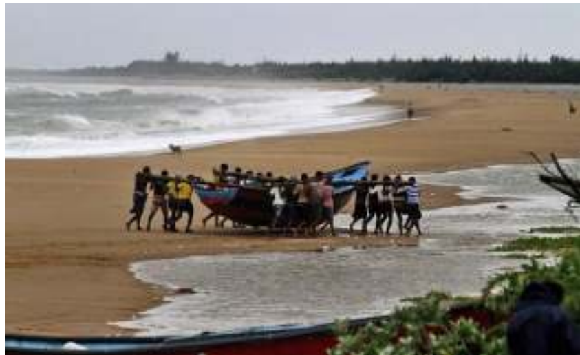
Cyclone Ravage: HUDHUD causes extensive damage in Gopalpur-on-sea.