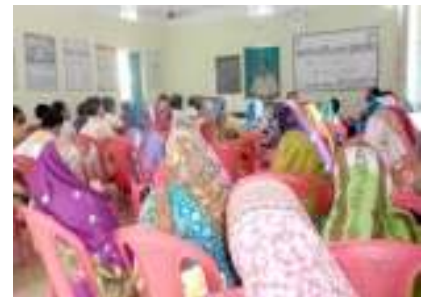
(Conducted Field Level Capacity Building of PRIs Training Under NCBF AAP of SURADA Block)