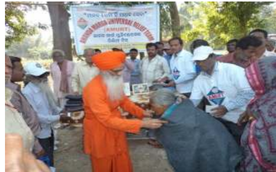
Blanket distribution in “HUDHUD” affected at Tanganapalli & Siddheswar village