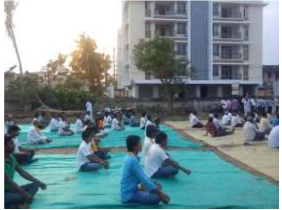
District Level Yoga Sikshya Sivr held at Kamapalli (Berhampur)