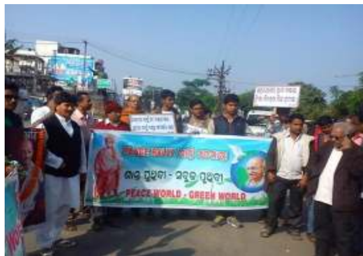
“Peace world Green world Mega Public Rally” under Biju Yuva Sashaktikaran Yojna- Nehru Yuba Kendra at Berhampur