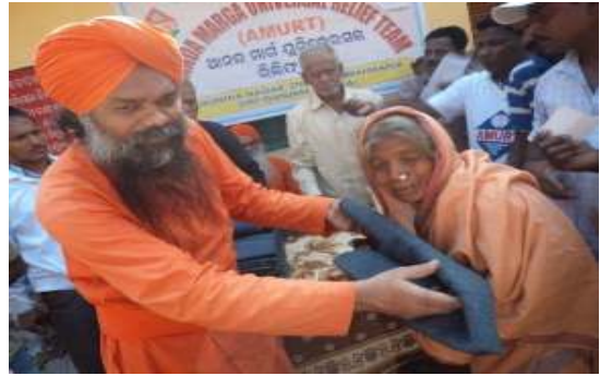
Blanket distribution in “HUDHUD” affected at Antarbattia village