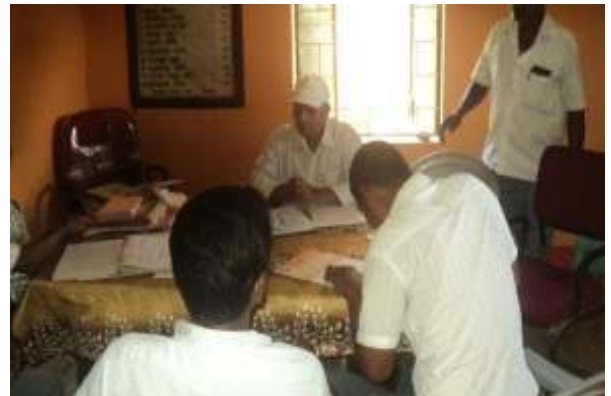
Concurrent Evaluation study & Work site of Mahatma Gandhi National Rural Employment Guarantee Act (MGNREGA) at Ganjam, Cuttack, Jajpur, Balasore and Mayurbhanj District in Odisha