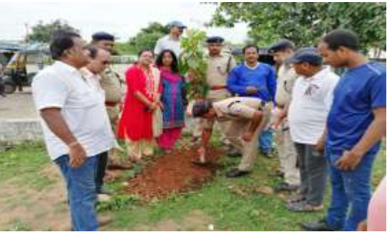
PLANTATION Programme on the occasion of Bana Mahostav with BeDA, Brahmapur