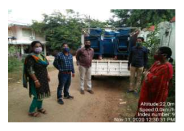
Ragi Thresher Machines unloading at C.H.C., Laxmipur in presence of VAWs, CDPO of ICDS, B.P.C. of PROGREESS.