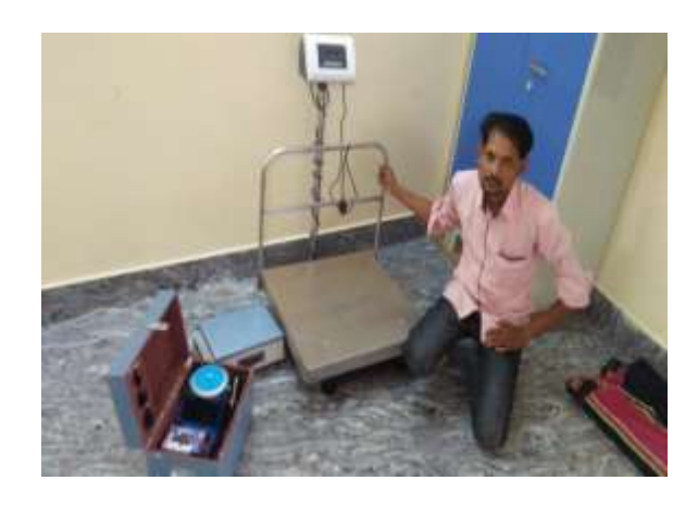
Weighing Machine & Moisture Meter at Seed Center, Laxmipur (Tatabali)