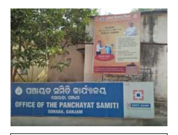
Millet Procurement Hoarding at B.D.O. Office, Sorada