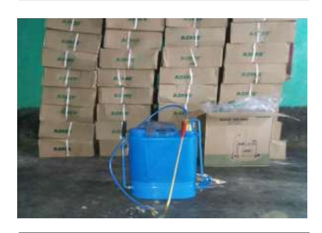
Sprayer Machines at CHC, Laxmipur