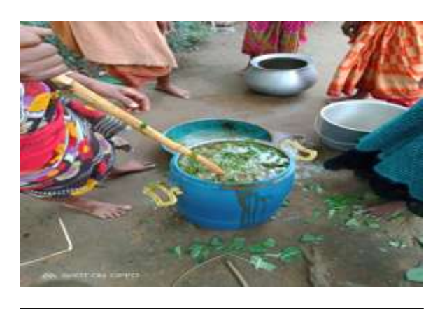
Jeevamrut (Bio-Fertilizer) prepared by SHG members