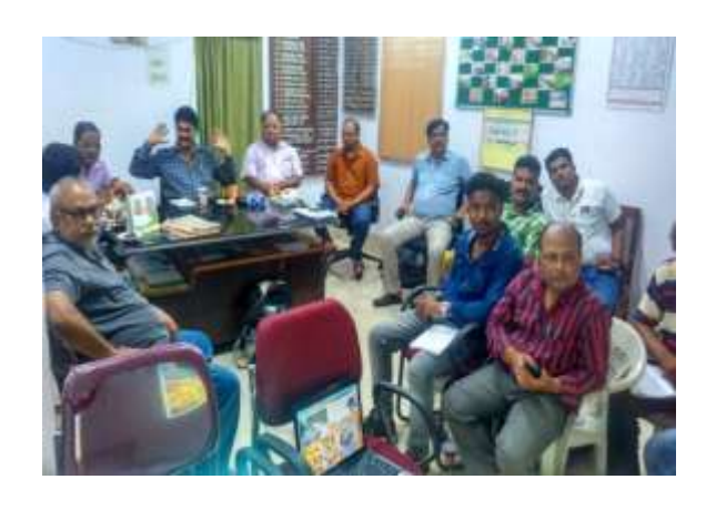
Monthly Review Meetings of Block Stafffs held at O/o CDAO, Ganjam