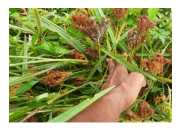
Ragi harvesting stage at Dhanapur