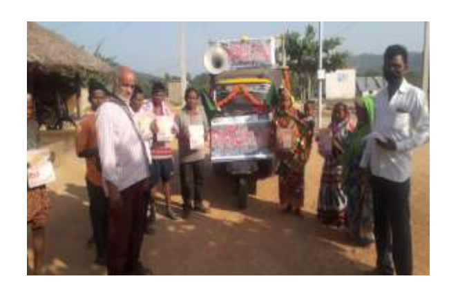
Awareness Campaign by Millet Rath for Ragi Procurement in villages of Sorada Block