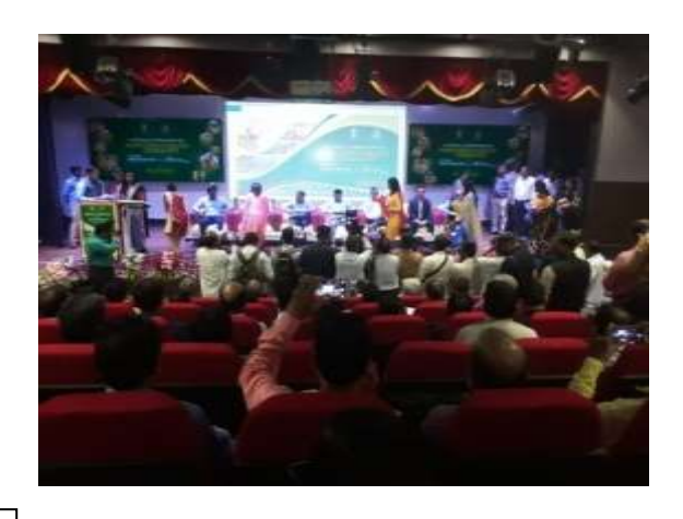
National Conversation of Agriculture at Bhubaneswar