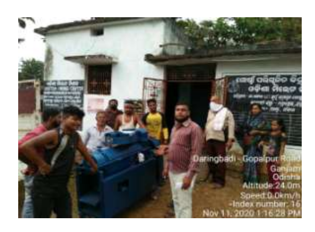
Ragi Thresher Machines at C.H.C., Laxmipur