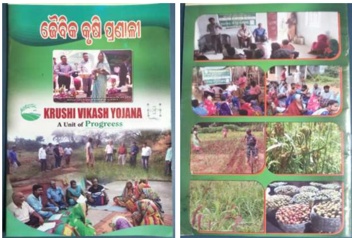
Book published by the PROGRESS