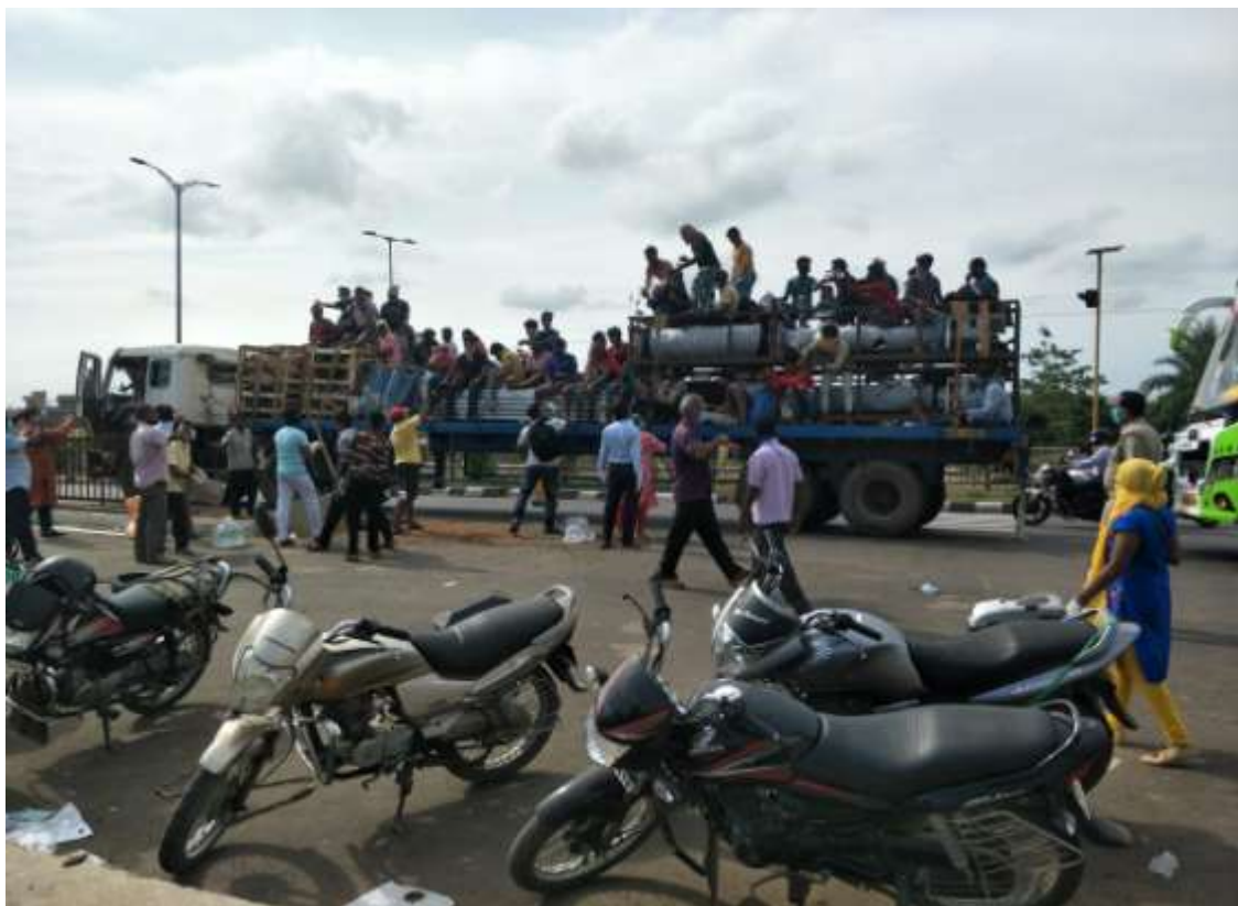
Relief Material for Migrant labours during Covid-19 at NH-16