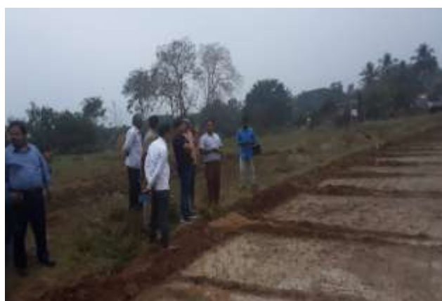
Ganjam Collector visited Community Nursery Bed at different villages of Sorada Block