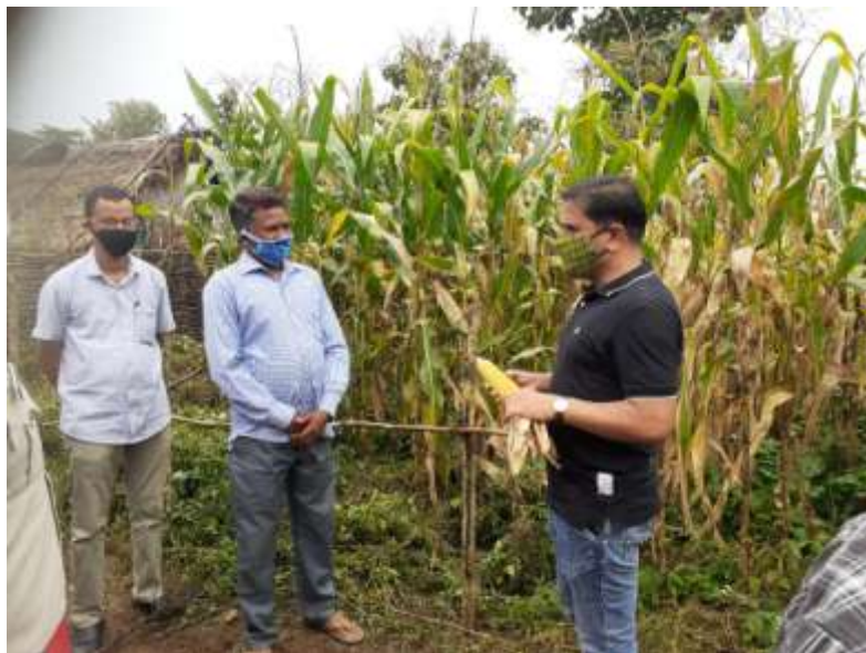
District Collector of Ganjam visited Maize field at D.Balapanka Block of Sorada Block (PKVY)