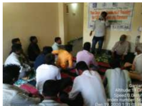
Two days Residential Training for CRP & Progressive Farmers