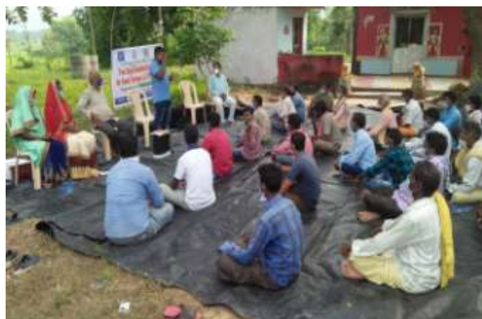
Two days Non- Residential Training for Seed Farmers & FPO Members