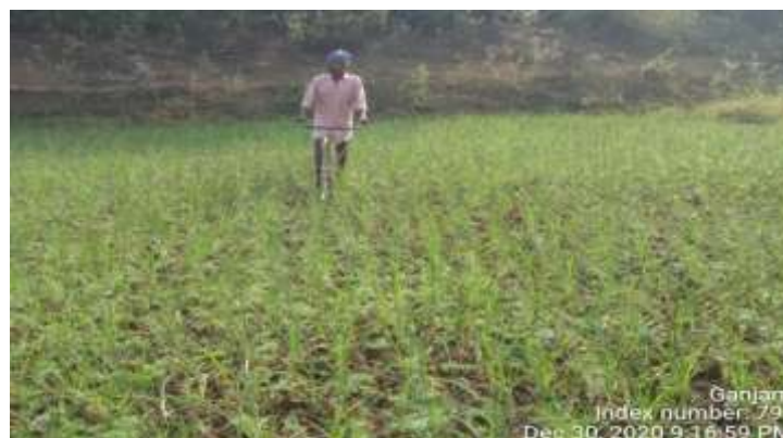
CYCLE WEEDER applying in different fields of Sorada Block