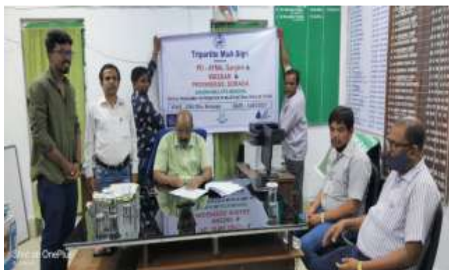
Tripartite MoA signed with OMM, CDAO & PROGREESS at O/o CDAO, Berhampur