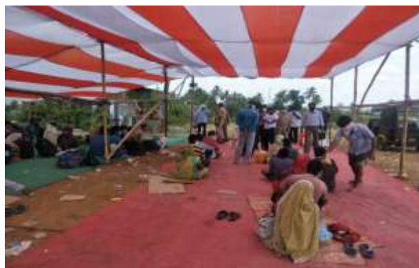
Relief material distributed to Migrant labour on Covid-19 resond at Golanthara PS