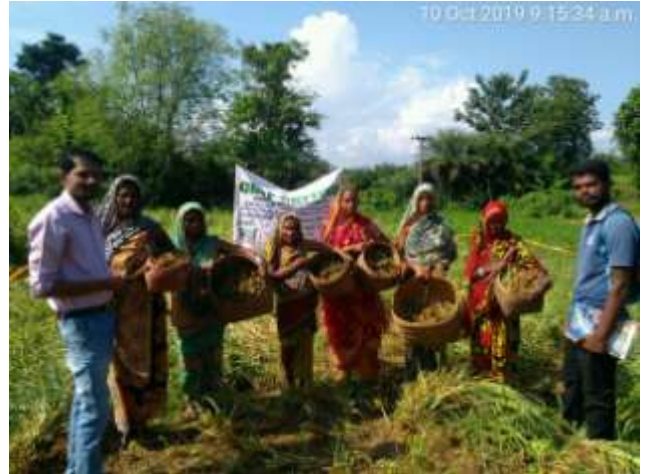
Millet CROP CUTTING in different villages of Sorada Block