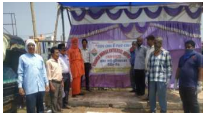
Relief materials distributed towards Migrant labour while walking on NH-16 (Lanjipalli Bye-pass) in Covid-19 respond