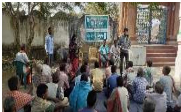
Farmer Group Awareness Programme under OIIPCRA at Sorada & Dharakote Block