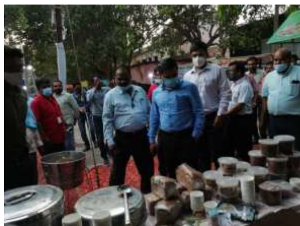
District Collector of Ganjam visited Millet Food Festival at CDAO office Campus, Berhampur