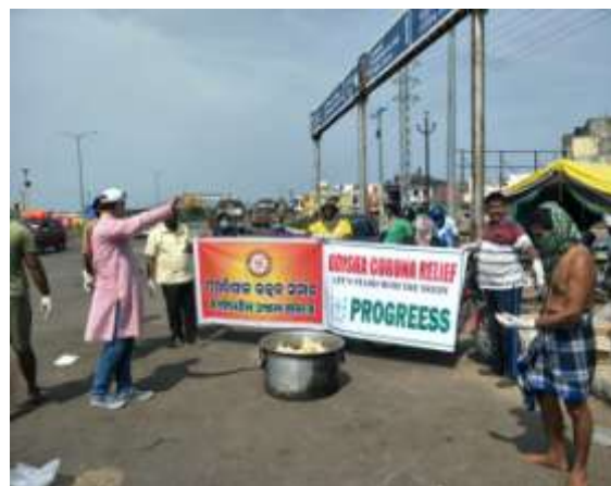
Relief materials distributed towards Migrant labour while walking on NH-16 (Lanjipalli Bye-pass) in Covid-19 respond