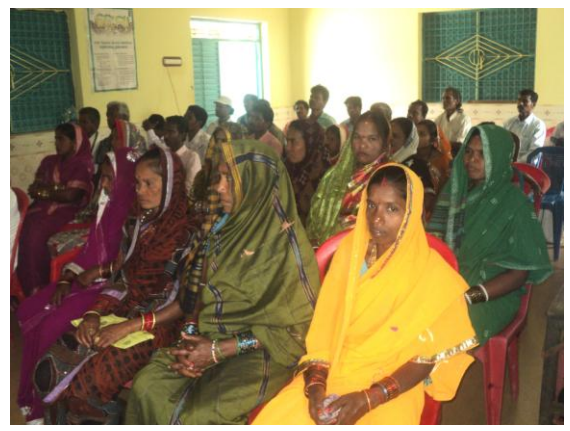
(Conducted Field Level Capacity Building of PRIs Training Under NCBF AAP of GANJAM & SORODA Block)