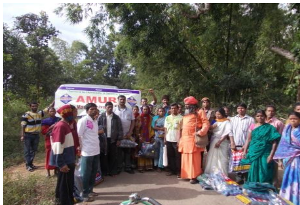
Blanket & Dry food distribution in “Philine” affected at Subalada & Chelagada villages