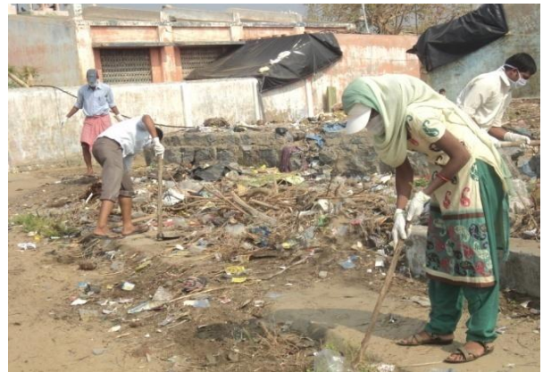
Health Hygienic & Sanitation protection Campaigning at Lanjipalli slum area under B.M.C.