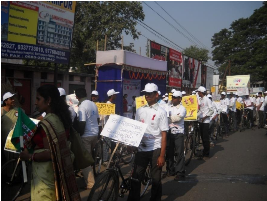
Public Rally in World AIDS Day at Berhampur city