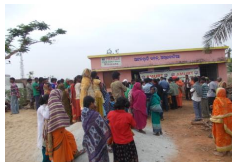
Blanket distribution in “Philine” affected at Antarbattia village