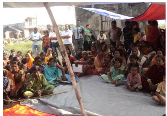
Enumerators induction training, survey & Community Meeting by UNICEF - WASH at Keluapalli.