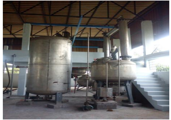
Conducted a study on meeting the non-financial gaps in Kewda Processing Unit at Chamakhandi