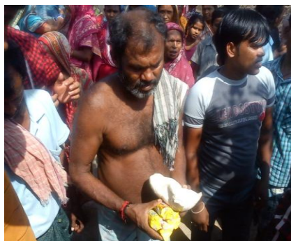
Dry food distribution in “Philine” affected at Rajapur & Sonpur village