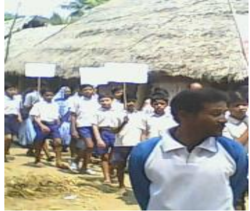
Rally with school students on the occasion of World TB Day at Alasu, Rauti & Kadua vilages