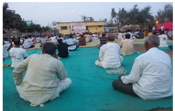
District Level Yoga Sikshya Sivr held at Kamapalli (Berhampur)