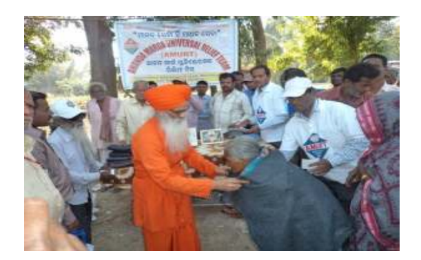
Blanket distribution in "HUDHUD" affected at Tanganapalli & Siddheswar village