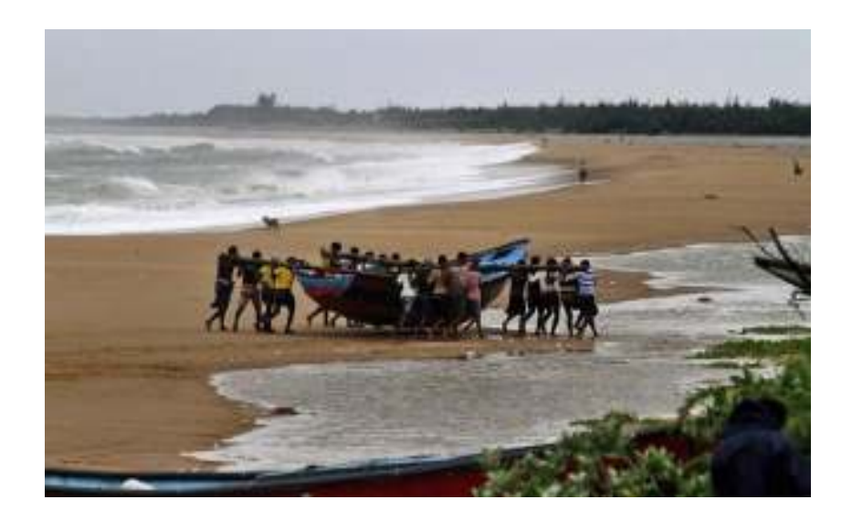
Cyclone Ravage: HUDHUD causes extensive damage in Gopalpur-on-sea.