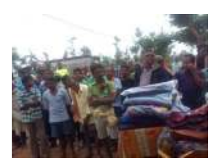
Blanket distribution in "HUDHUD" affected at Subalada & Chelligada village of Gajapati District