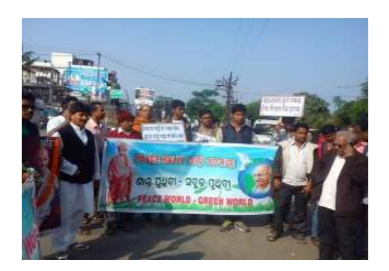
"Peace world Green world Mega Public Rally" under Biju Yuva Sashaktikaran Yojna- Nehru Yuba Kendra at Berhampur