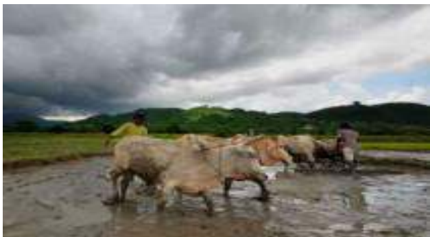
Climate Change effect