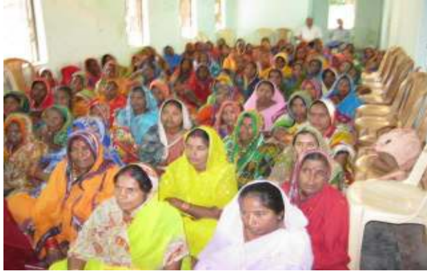
Right to information, Consumer Rights & Human Rights Counseling & Capacity Building & Organized Awareness Camp at Berhampur