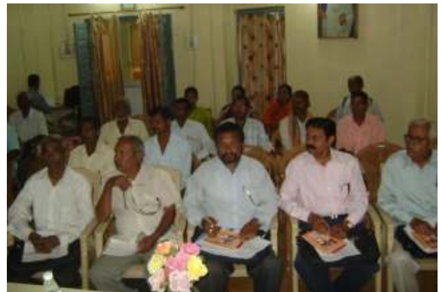
Awareness cum Training program of Farmer