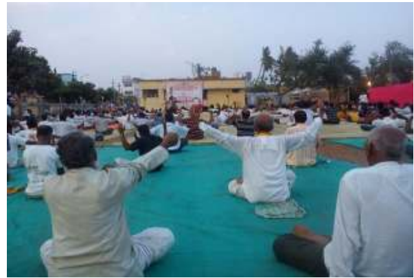
Observed International Yoga Day at R.C.Das Lane, Berhampur (Office Premises)