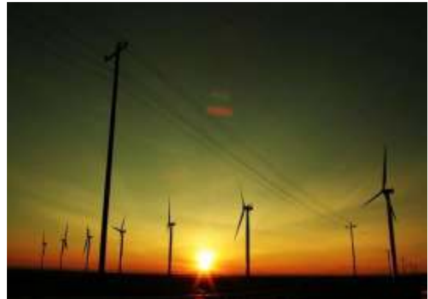
Awareness of Use Alternative Energy Sources