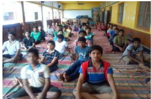
Yoga Training at Saraswati Sishu Bidya Mandir at Ramahari Nagar, Berhampur