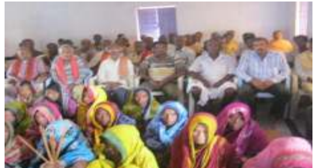
World AIDS day Meeting at Berhampur