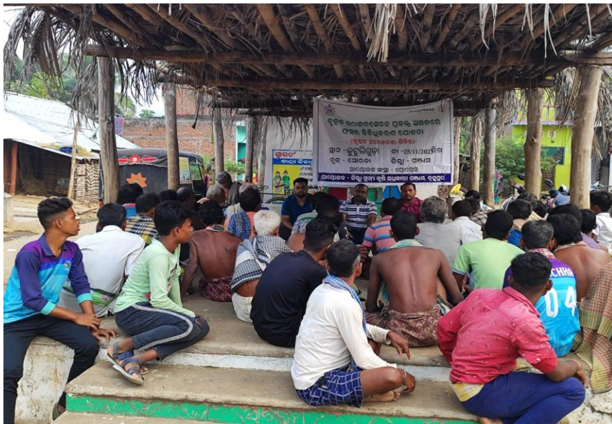
CDP-MLIP Meeting programme at different places in Sorada Block