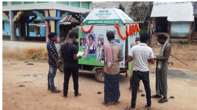
Awareness Campaign by Millet Rath for Household Consumption & Ragi Procurement in Mandi in Sorada Block