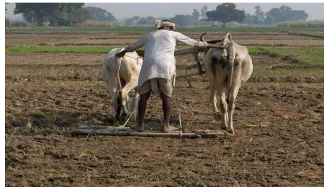
District Collector of Ganjam visited Millet field at Goudagotha and Lokamari (OMM)