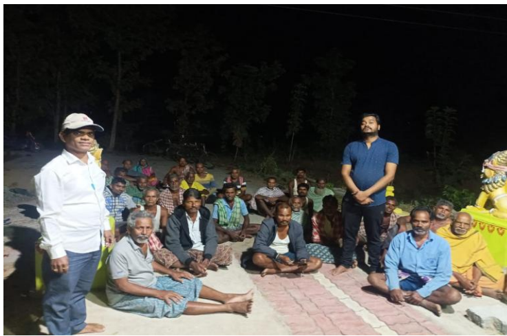
Farmer Group Awareness Programme at Sradhapur & Dhaugam under OIIPCRA in Dharakote Block