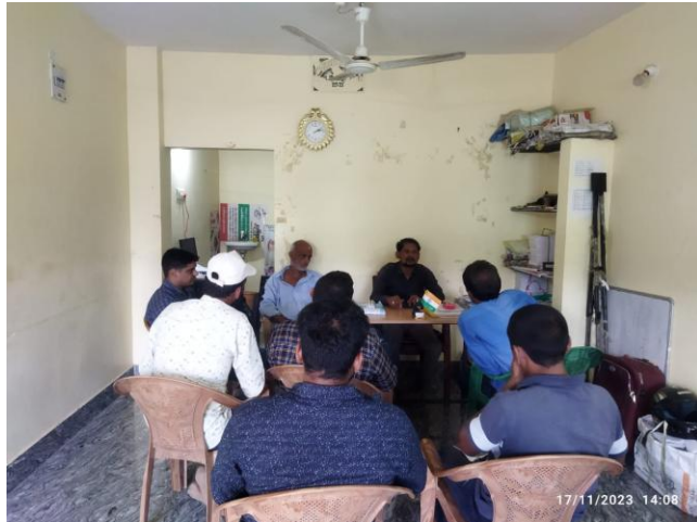
CRP Orientation Meeting at our Surada Office