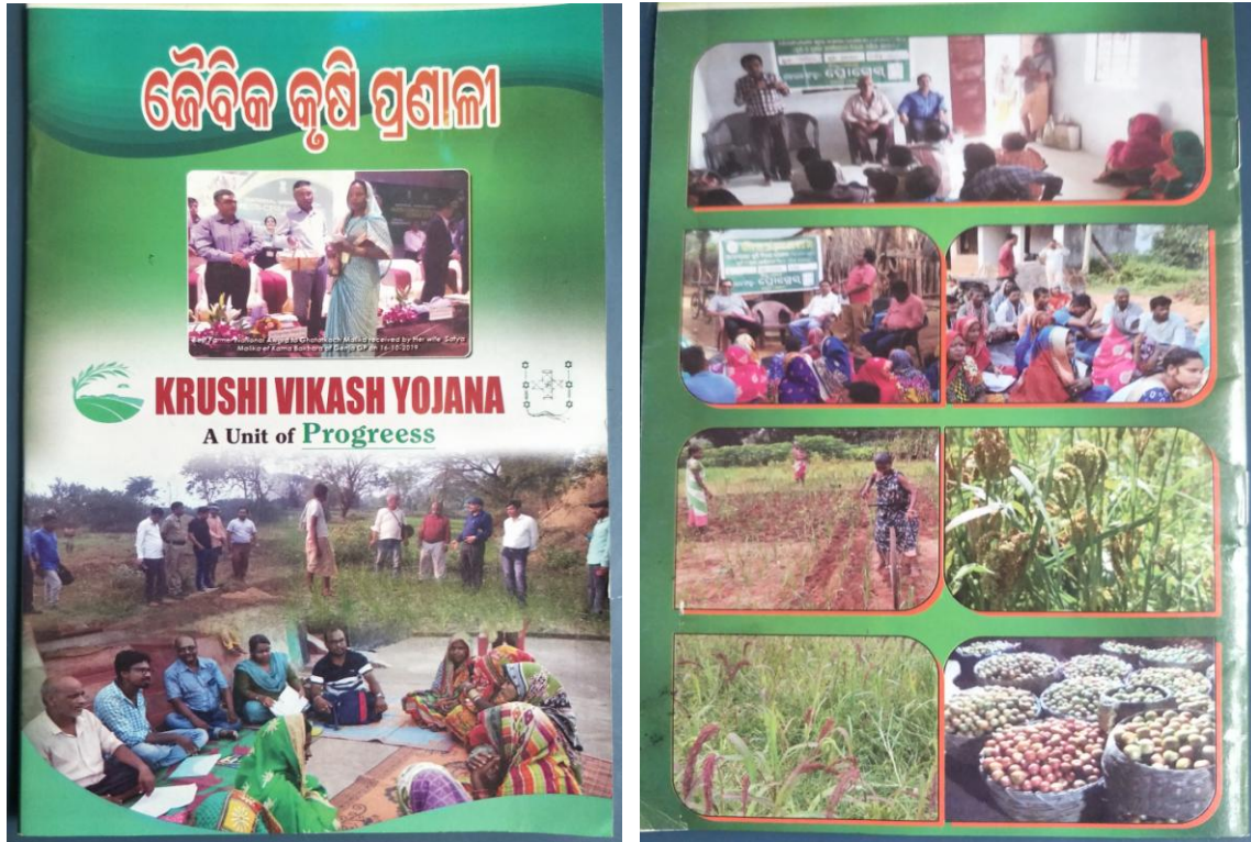
Book published by the PROGRESS