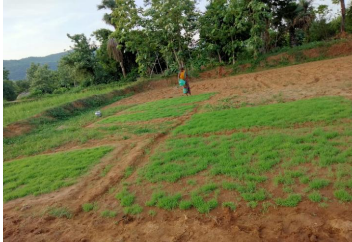
Ragi Field at Kulangi