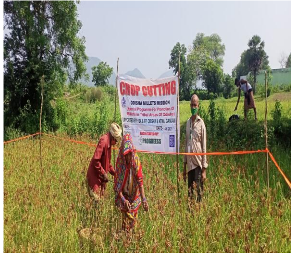
Crop Cutting at Goudagotha & Merikote in Surada Block