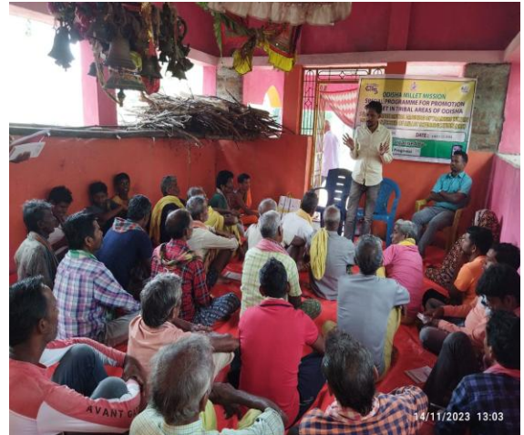
Two days Residential Training for CRP & Progressive Farmers