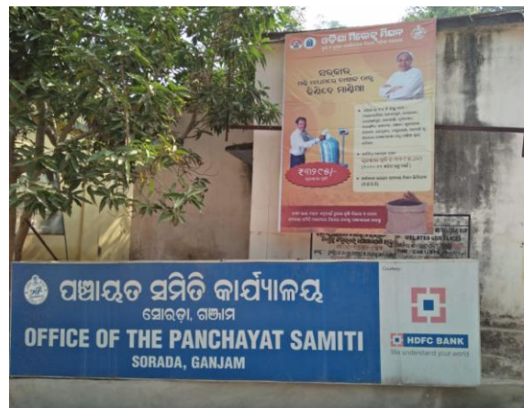
Publicity of Millets by fixation of Hoarding