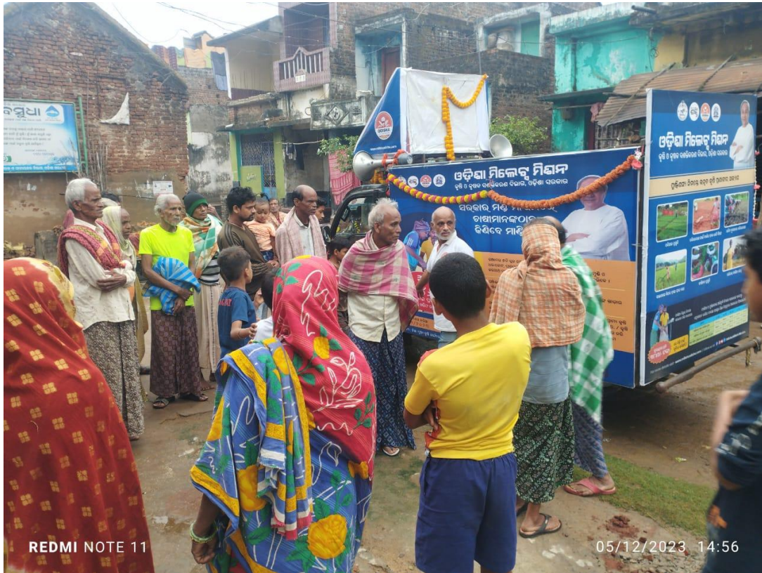
Discussed between farmers regarding procurements of Ragi crops at Bhagabanpur