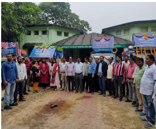
Inauguration of Rath at CDAO Office