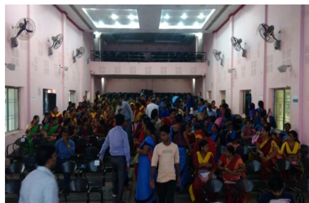
Observation of World TB Day Meeting was held at Town Hall, Brahmapur.