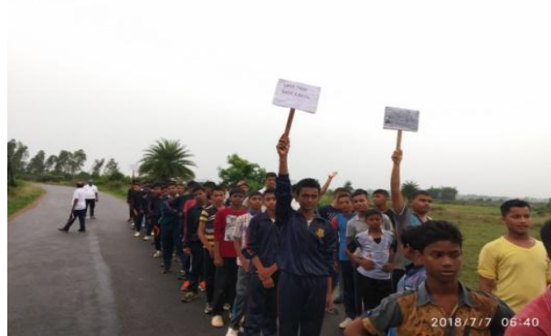
Swachha Bharat campaign at SAHAPUR Gram Panchayat (Ganjam)