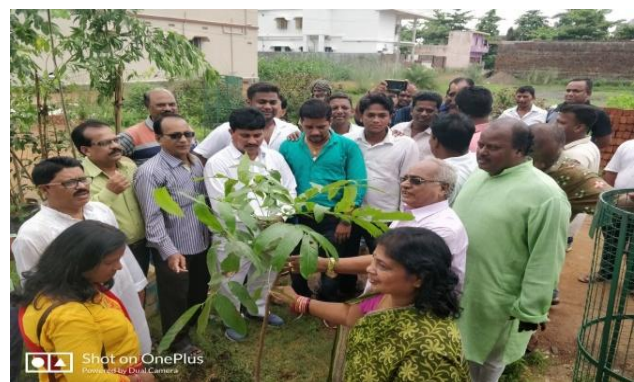
PLANTATION Programme on the occasion of Bana Mahostav with BeDA, Brahmapur