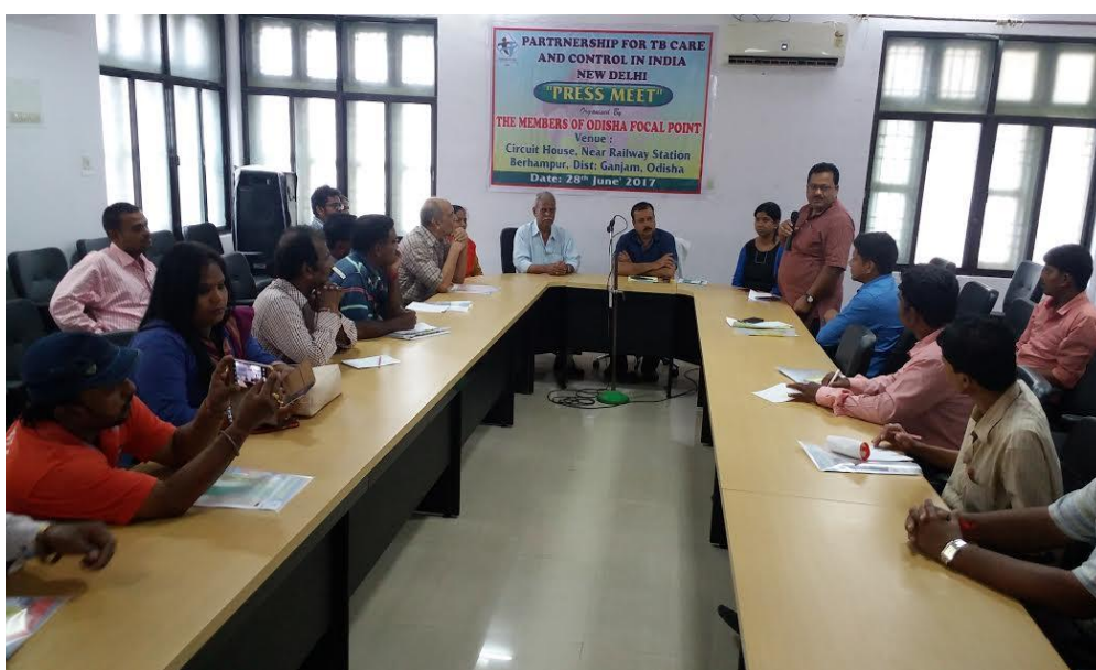
Press Meet of Member of Odisha Focal point on TB –(Media Advocacy) organised at Circuit House, Berhampur