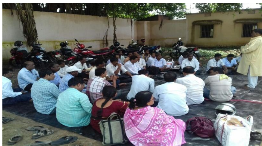
Human Rights Awareness meeting at Berhampur