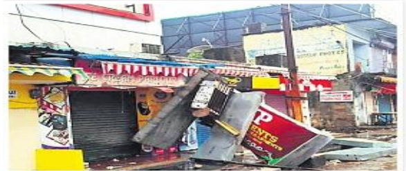
■ A damaged shop at Girija Square in Berhampur