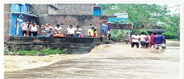
■ Floodwater overflowing in Reddy Damodarapalli village under Dharakate block in Ganjam district

In this situation, The Relief Materials distributed by the AMURT-Global in following details:-