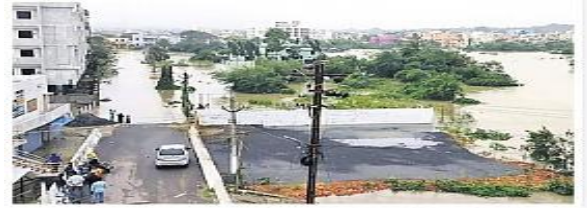
■ Heavy water-logging was witnessed in residential areas in Berhampur following heavy rainfall during the cyclonic storm