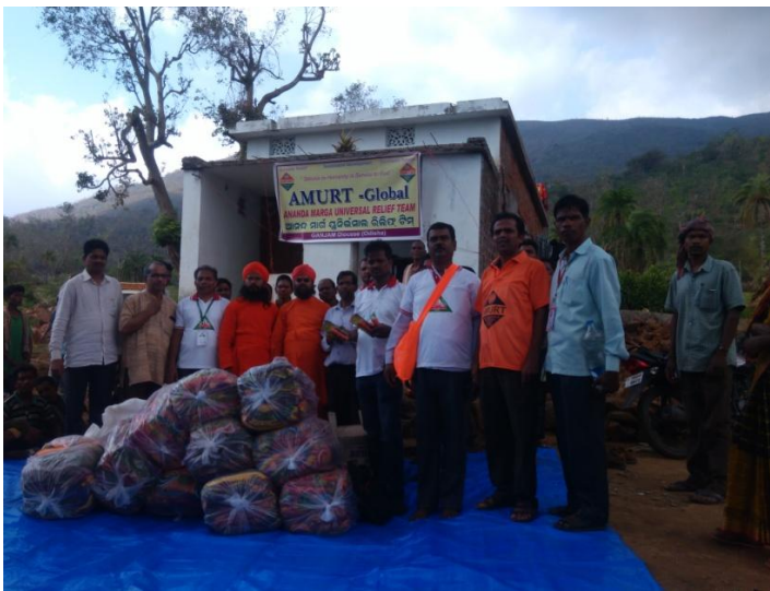
Scanned by CamScanner

ଖଣ୍ଡଗିରିରୁ ଆନନ୍ଦ ମାର୍ଗର ସେବା କାର୍ଯ୍ୟ ପ୍ରଦାନ କରାଯାଇ ପାରେ। ଆନନ୍ଦ ମାର୍ଗର ସେବା କାର୍ଯ୍ୟ ପ୍ରଦାନ କରାଯାଇ ପାରେ। ଆନନ୍ଦ ମାର୍ଗର ସେବା କାର୍ଯ୍ୟ ପ୍ରଦାନ କରାଯାଇ ପାରେ। ଆନନ୍ଦ ମାର୍ଗର ସେବା କାର୍ଯ୍ୟ ପ୍ରଦାନ କରାଯାଇ ପାରେ।