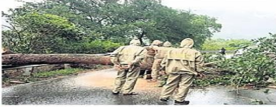
■ ODRAF personnel clearing the Sunki ghat in Korapat for communication after a large tree fell down on the road