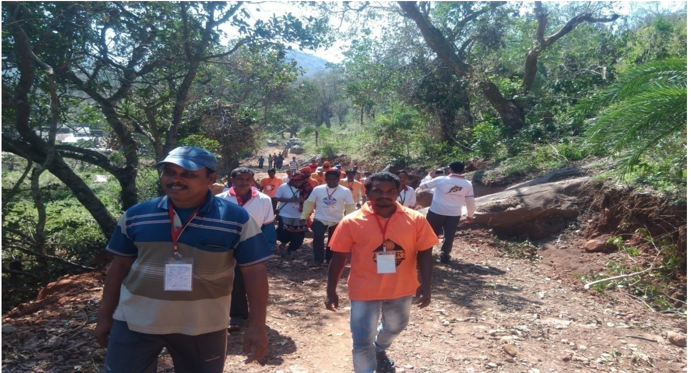
(AMURT Volunteers immediate rush the inaccessible place of disaster affected village)

The Relief services have been conducted at Gajapati District (Odisha). Aroud 40 volunteers, Ac' Jaishivananda Avt'(Diocese Secretary- Ganjam ) and Ac' Prabhadrnanda Avt' (Diocese Secretary-Bhubaneswar) were also involved on the said natural incidental programme. AMURT has been continuing the relief & community services also have performed Kitchen Camp and Health Camp in the affected villages of R.Udayagiri, Rayagada and Nuagada Block by the active involvement of 30-40 volunteers.