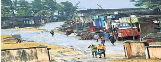
■ Residents in Ganjam negotiating their way in gusty winds as the cyclonic storm makes landfall in the wee hours of Thursday