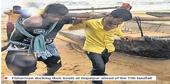
■ Fishermen docking their boats at Gopajpur ahead of the Titi landfall