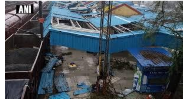
Palasa Rliilway Station Devastation