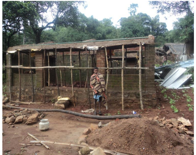
Trees fallen on the houses